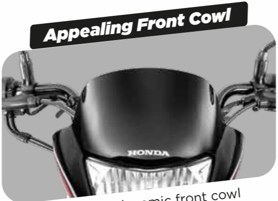
Appealing Front Cowl

Beautiful tank and side graphics increase your shine.