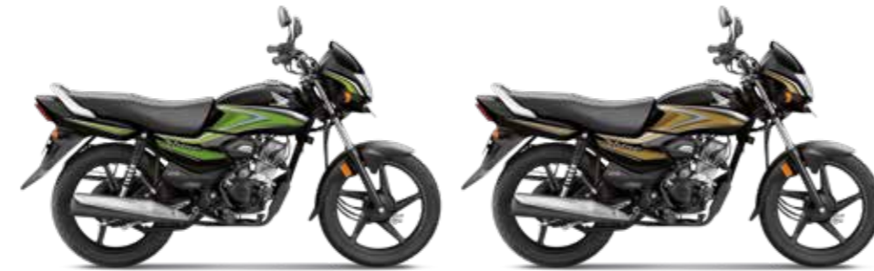
Black With Green Black With Gold