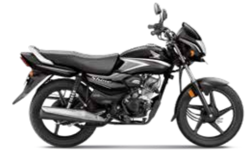
Black With Grey

BOOK ONLINE NOW! www.honda2wheelersindia.com