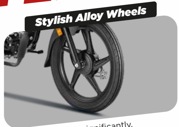
Stylish Alloy Wheels